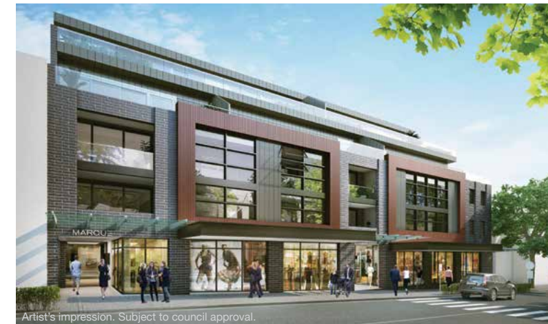
Artist's impression. Subject to council approval.

Established in 1971, Nettleton Tribe, based locally in Crows Nest, is a leading architectural practice servicing Australia and abroad. Their innovative design philosophy from concept to detail have made a positive impact on the way in which people reside and work. Over the past 40 years their leadership in the industry has seen their projects win numerous awards from leading associations including the National Trust, AIA, PCA, UDIA and Urban Taskforce of Australia.