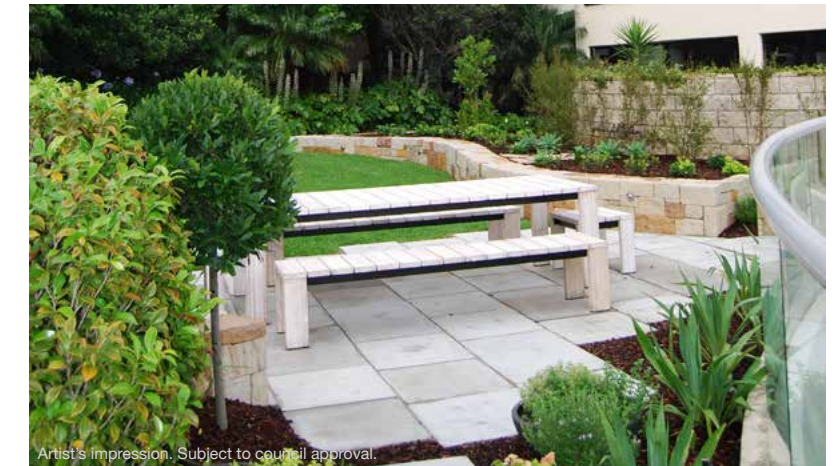
Artist's impression. Subject to council approval.

Black Beetle is a landscape architectural and art practice focused on providing thoughtful and innovative designs. Black Beetle has built a diverse body of work that melds nature and architecture to create quality designs that are inspirational, fresh and high performing.