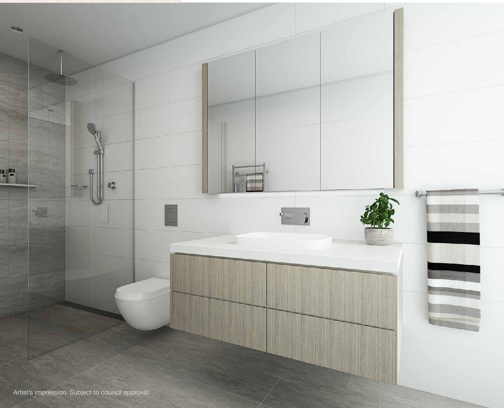
Artist's impression. Subject to council approval.

With meticulous attention to detail and planning, the team pride themselves on creating buildings that make a long term high quality contribution to the urban landscape and provide residents with beautifully designed living spaces, perfectly suited for modern urban living.